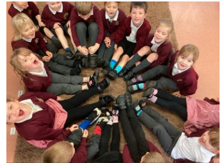
Odd Sock Fun in Little Oaks

Thank you to everyone who entered our 'Design A Pair of Odd Socks competition' to help us remember we are all different. All the entries were fantastic and our winners enjoyed a £5 Book Token each.