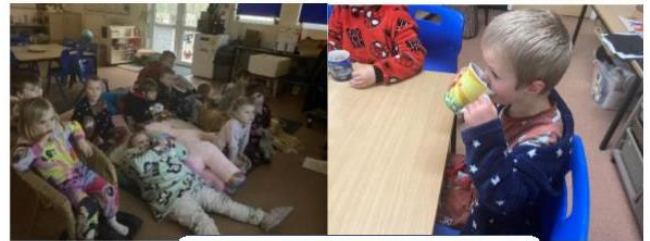
Little Oaks enjoying their cosy bedtime stories.

We hope you enjoyed seeing the teachers in their PJ's!