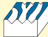
Relief: prints what is left of the original surface