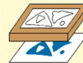
Stencil: prints through open areas in screen