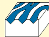
Intaglio: prints what is below the surface